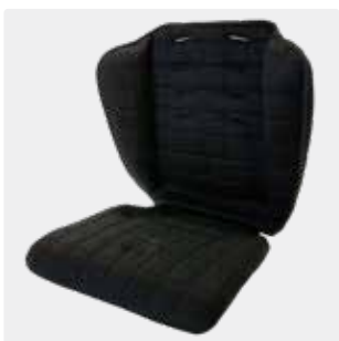
Spica insert cushion