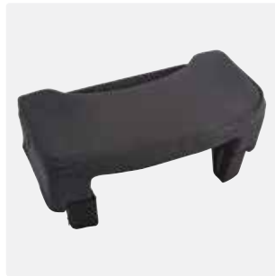
Support tray with pads