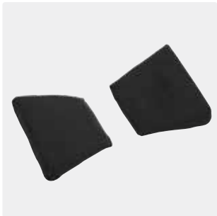
Trunk positioning pads