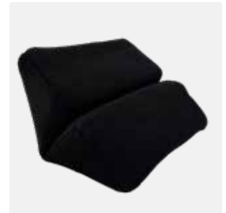
Spica Positioning Wedge