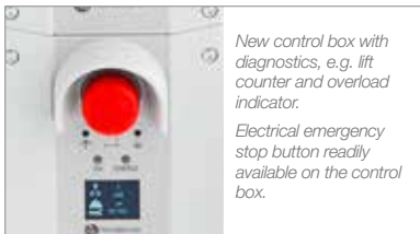
New control box with diagnostics, e.g. lift counter and overload indicator. Electrical emergency stop button readily available on the control box.