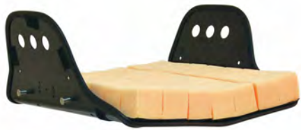
Available in Visco Foam and Poly Foam

Future Mobility's Prism TrueFitt™ model is designed for end users with specific health conditions such as Kyphosis, Lordosis, Scoliosis or protruding gibbous deformities. Depending on the condition, our staff can customize this wheelchair back to meet their needs and provide the best in support.