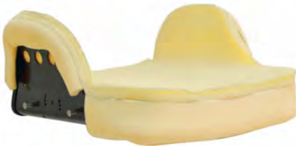
Cover, Foam Layers and Aluminum Hardware