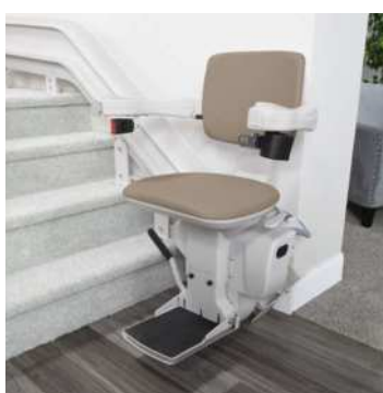
Not all options are shown.