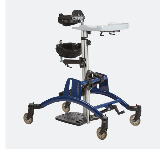
No driving wheels, 4 castors with brakes. Prepared for driving wheels, 4 castors with brakes