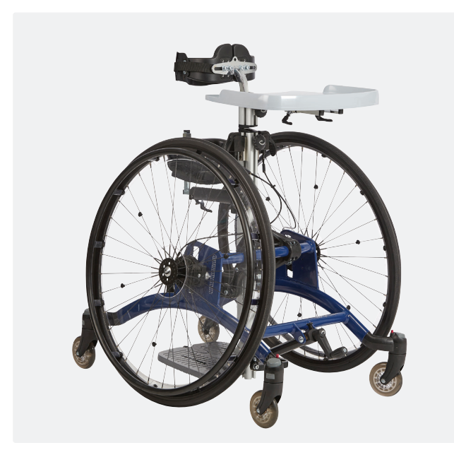
2 driving wheels, 4 castors with or without brakes.