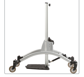
Size 4: Silver