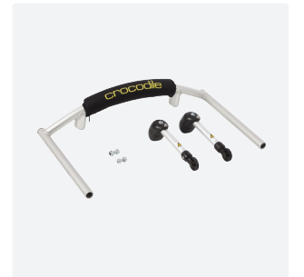
Starter kit 86801-0