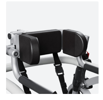
Gator back and side supports 86808, 86809