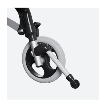
Anti-tips, fixed 86815-F, 86815-3F