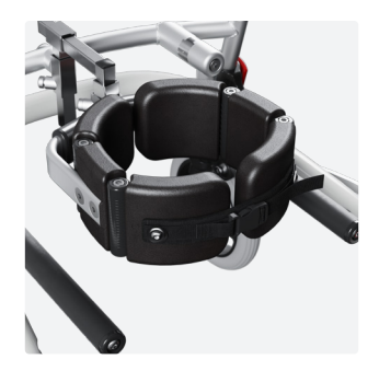
Surrounding support 868610