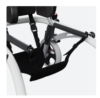
Sling seat, light weight 8682x-1