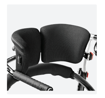
Back support 86886x, 86816