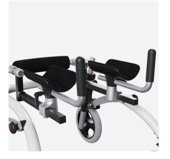
Forearm support w/handgrip 95145-x