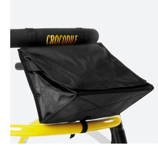
Bag 86839, 86843