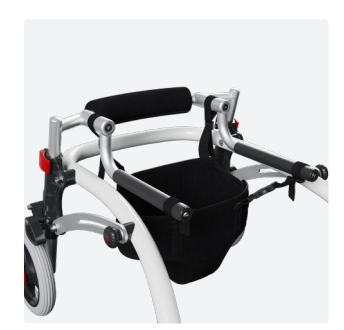
Sling seat 8682x