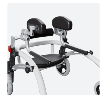
Hip supports 86819