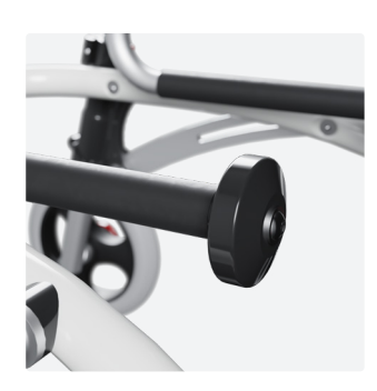
Handle knobs 86861