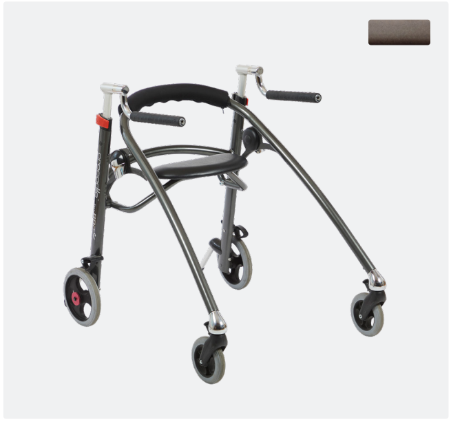
Size 3 Available in anthacite grey