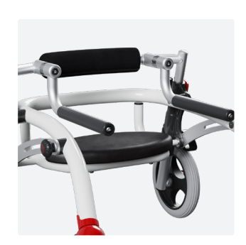
Flip down seat 8682x