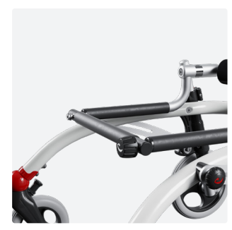
Grip bar 86879-x