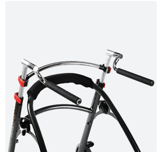
Cross bar 86880