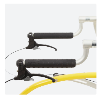
Decelerating hand brake kit 86834-DEC, 86873-DEC