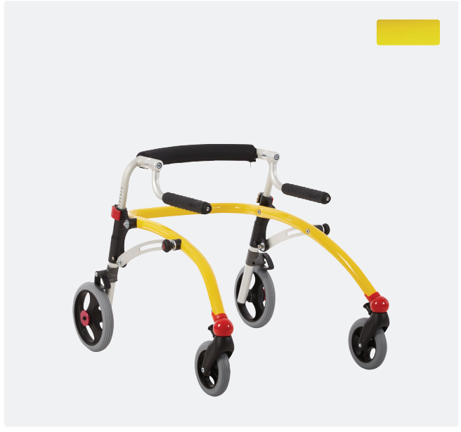
Size 1 Available in yellow