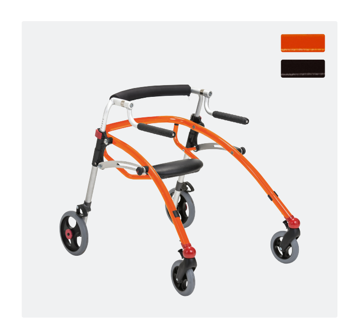
Size 2 Available in orange and metallic black

^{\ast}\text{Mounted} with the Starter kit accessory. Further measurements on our website