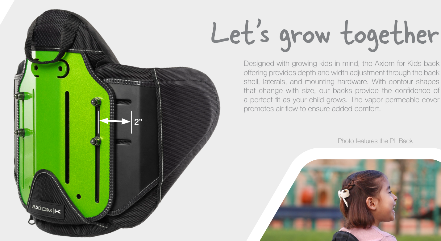
AL Back with contoured laterals

Choose from 3 color options to complement the mobility base and the personal style and preferences of the smallest clients. Available in Blue, Purple and Black,