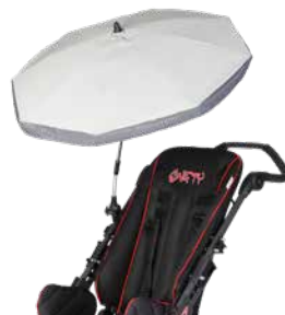
Umbrella and frame padding (shown on size 1)