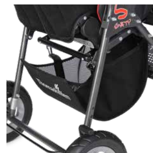
Basket (shown on size 1)