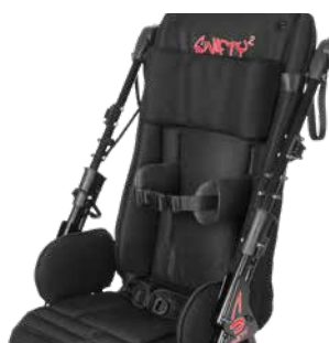
Head pillow, lateral trunk support with chest belt and 2-point pelvic harness (shown on size 2)