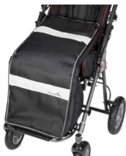
Sleeping bag, padded (summer) or woven fur (winter) (shown on size 1)