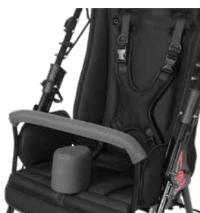
Butterfly chest harness (flexible), abduction block and grip rail (shown on size 2)