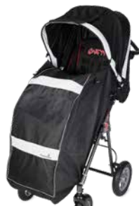
Sun and rain cover with leg blanket (shown on size 2)