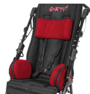
Seat minimizer, available in black and red (red only for size 2 as shown)

You will find the total overview of all accessories in the order form or on our website: www.thomashilfen.com