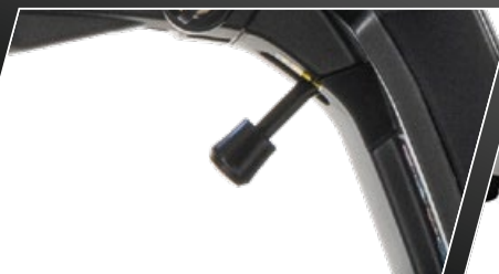
Tiller adjustment lever