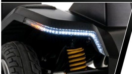
Front LED lights