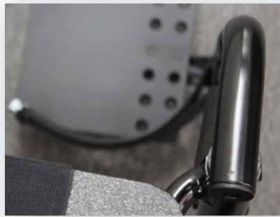
Center Pivot Swing In And Swing Out Front Rigging