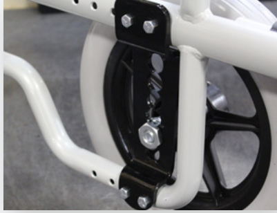
Rear Axle Adjustability