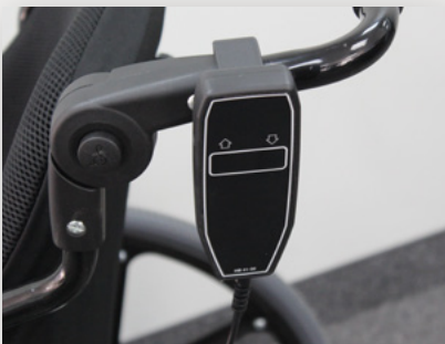
Power Tilt Option