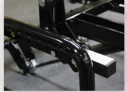
Rear Depth Adjustable Frame