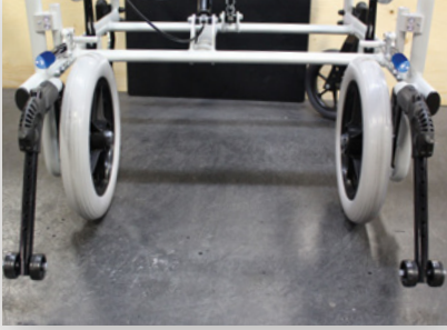
Narrow Configuration (Inside Wheel Mount)